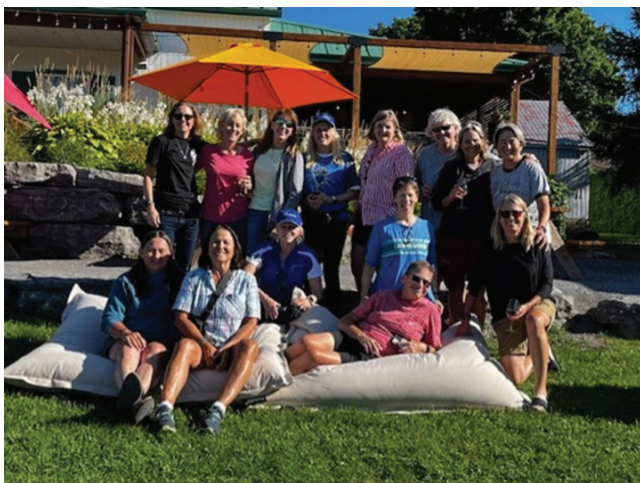
Zone 3 55+ Outlaws