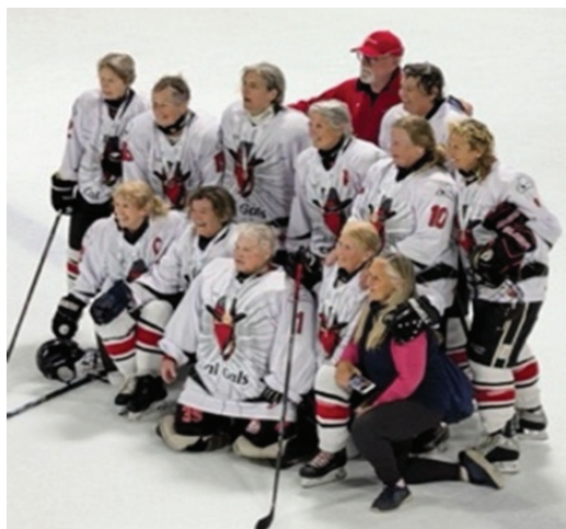
Zone 3 Women 65+ Bronze Medalists With New Zone Uniforms