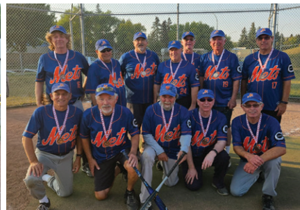
Mets Double A Bronze Medal Winners