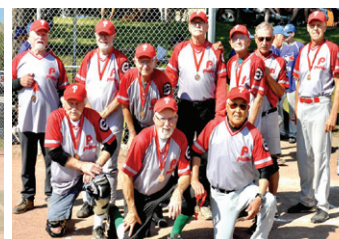
Phillies A Ball Bronze Medal Winners