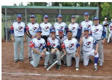
Jay Triple A Bronze Medal Winners