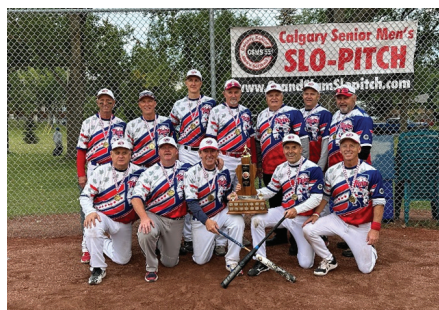
Twins Triple A Gold Medal Winners