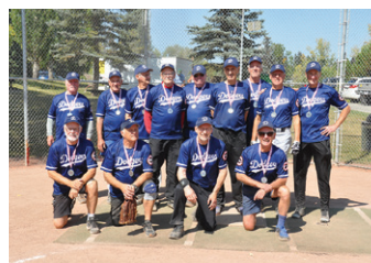
Dodgers A Ball Silver Medal Winners