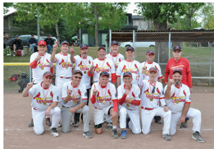
Cardinals Double A Gold Medal Winners