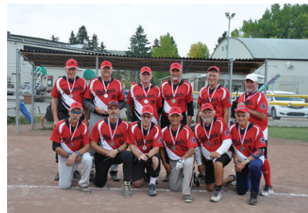
Nationals Double A Silver Medal Winners