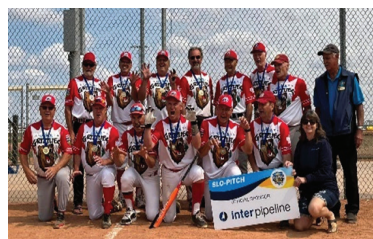
Grizzlies Zone 2 & Zone 3 Brooks Summer Games Gold Medal Winners