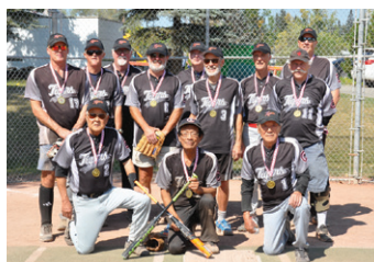
Tigers A Ball Gold Medal Winners