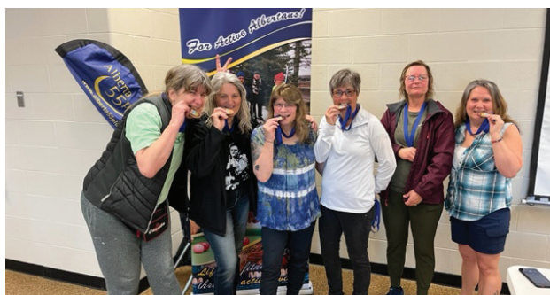
Zone 5 55+ Hockey Women's Bronze Medalists