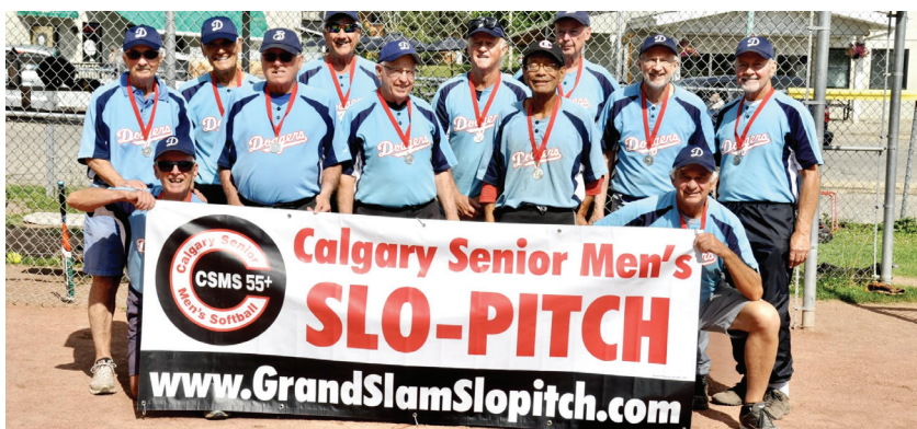
A Ball Dodgers - Silver Medalists