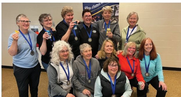
Zone 4 55 + Women's Hockey Silver Medalists