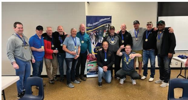
Zone 3 60 + Men's Hockey Gold Medalists