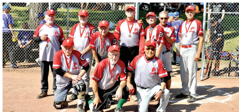
A Ball Phillies - Bronze Medalists