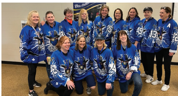
Zone 3 55 + Hockey Women's Gold Medalists