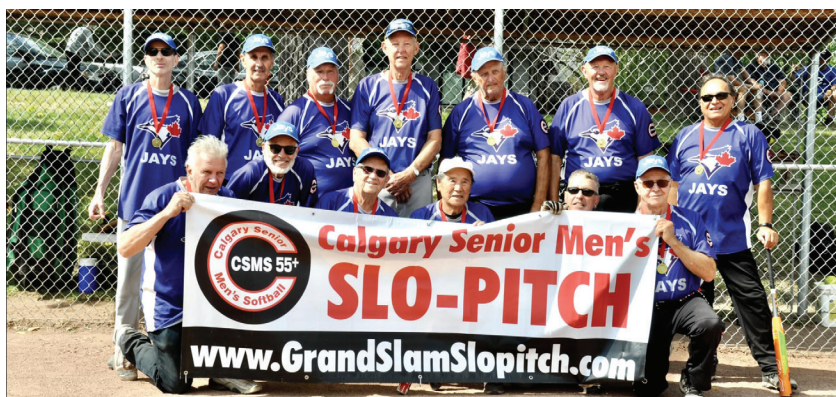
A Ball Jays - Gold Medalists