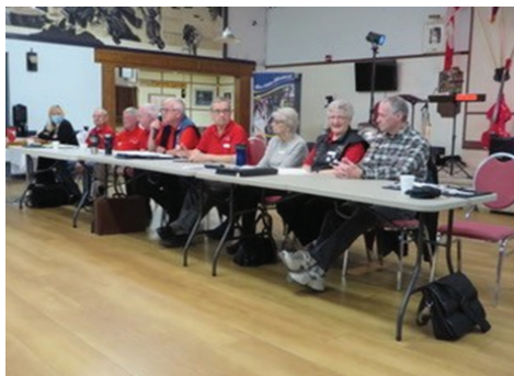
Calgary 55 plus Directors