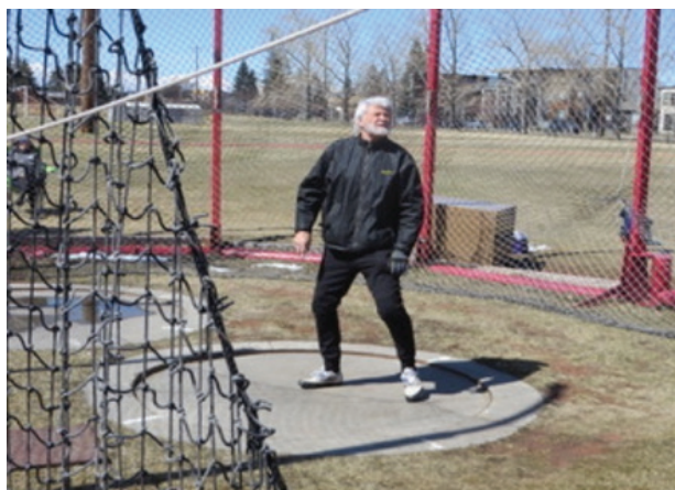
Al Vessey Track & Field