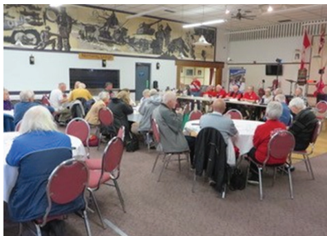
Members at the 2022 AGM

This year's AGM took place on March 28, 2022, at the Forest Lawn Legion. Over 50 members were in attendance, which was a great showing!