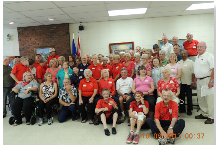
Fun Day at Thornview Senior Centre

The offered events included: Bocce, Horseshoes, Pool,